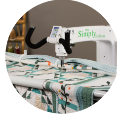
HQ Simply Sixteen®

Choose from the HQ Little Foot Frame or 8-foot Loft Frame