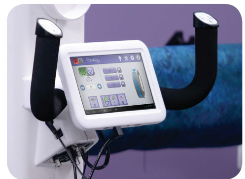
Easy-to-install rear handlebars