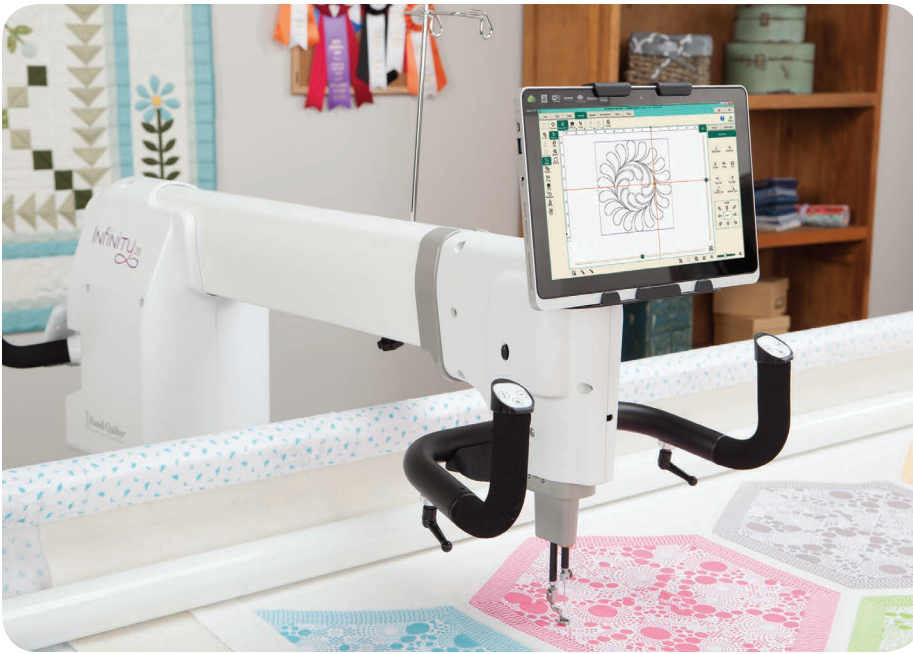
Pro-Stitcher Premium shown on the HQ Infinity.